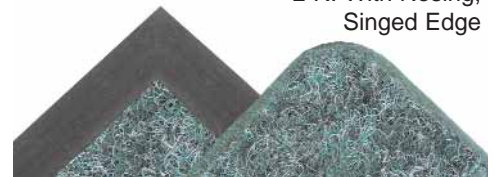
L-R: With Nosing, Singed Edge