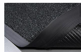
Sewn and glued heavy-duty beveled edging available

Compare Commercial Clean Machine® to other Crown products: